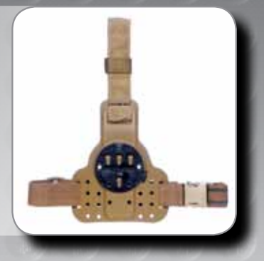
GCA 71 RTI DLS Drop Leg