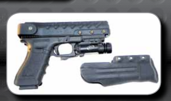
Interchangeable Light Cowling